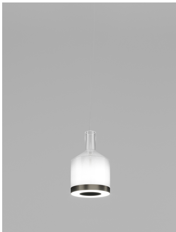
MEDEA SP 1 BCSF AVS L22 04 CE